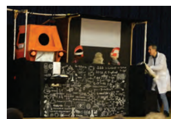
'A Cross His Story' Our Easter play for 2025

Do you know a young person who would like to consider having a Koru Gap Year with CRiBS? More information can be found via the QR code on the advert (see bottom right).