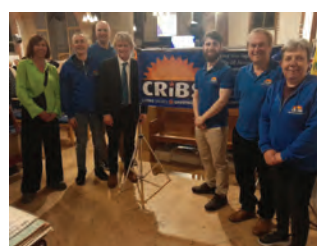
At the Easter Celebration